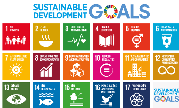
Investments aligned to the UN Goals

Our proprietary analytics looks under the bonnet of investment portfolios to show whether holdings are making positive contribution to the UN Goals. The chart below shows how Future Leaders compares with market indices: