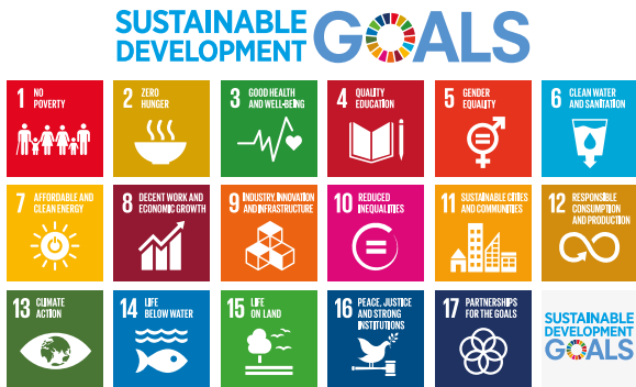
Comparison data as at March 2023.

Our proprietary analytics looks under the bonnet of investment portfolios to show whether holdings are making positive contribution to the UN Goals. The chart below shows how Sustainable World compares with market indices: